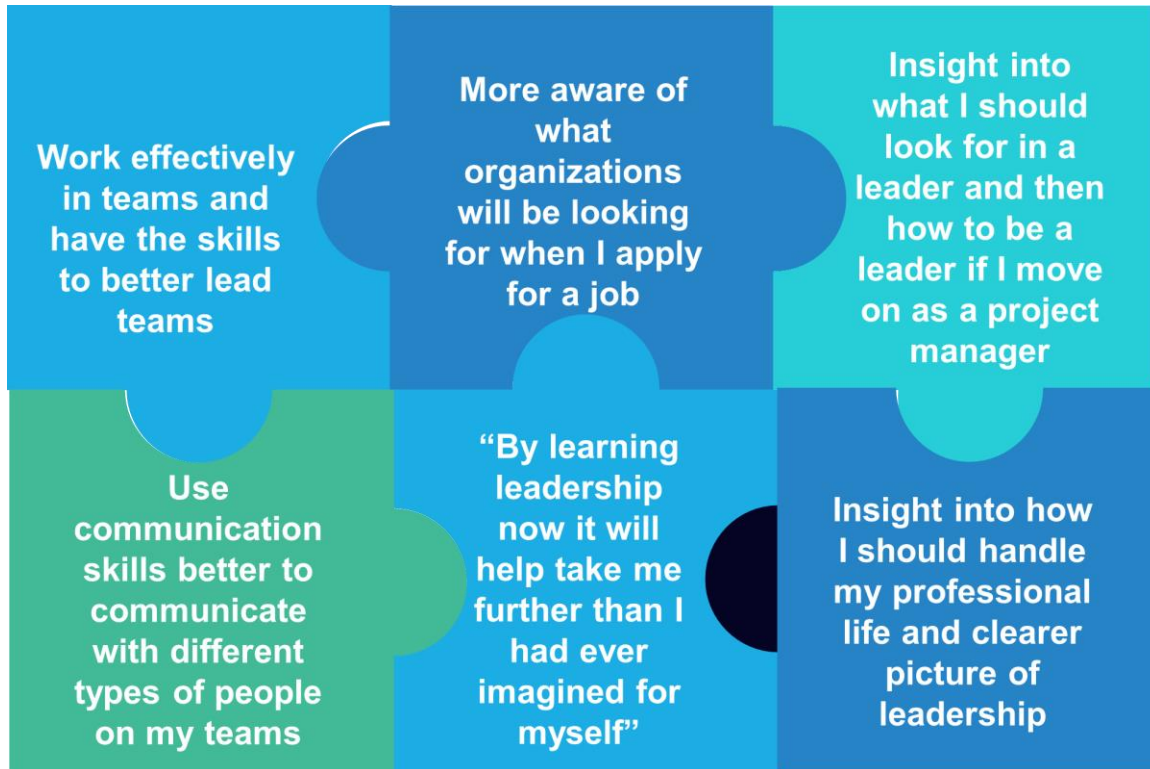
Figure 2. Professional Impact of Engineering Leadership Course

Some students discussed how this course would impact them as future leaders in the engineering field. Figure 2 captures some of the themes across their responses.