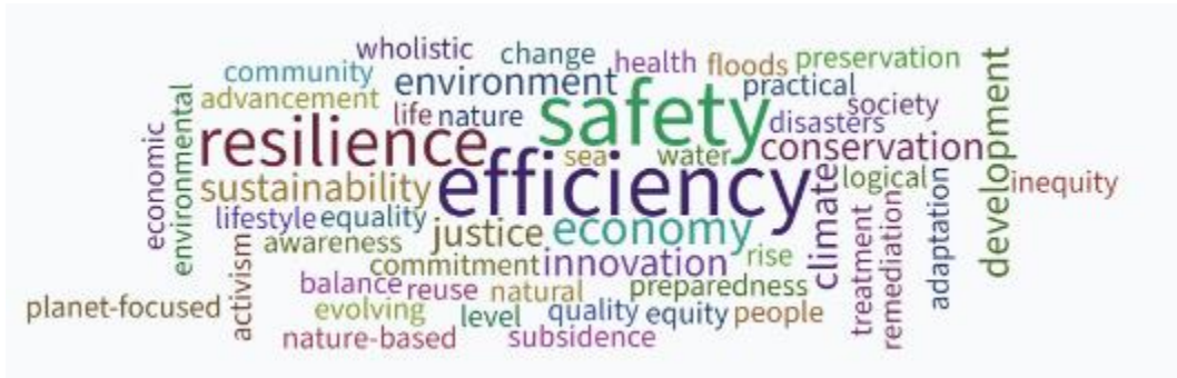
Figure 2: Example of a word-cloud created from the values identified by the class during the values hierarchy activity.

passion for addressing environmental injustice and how they were excited to learn more about it in this course. During the values hierarchy activity, a word cloud was generated by the entire class based off the values they thought were important for the sustainability of the system they chose to research, an example of which is shown in Figure 2. Extending these values to norms of society to be further reflected in the design requirements was an opportunity for the students to explore how sustainability considers the impacts and outcomes of the systems on all those who interact with it. For a more practical benefit, by asking students to take note of the values represented in other teams' systems, students were engaged during the project presentations.