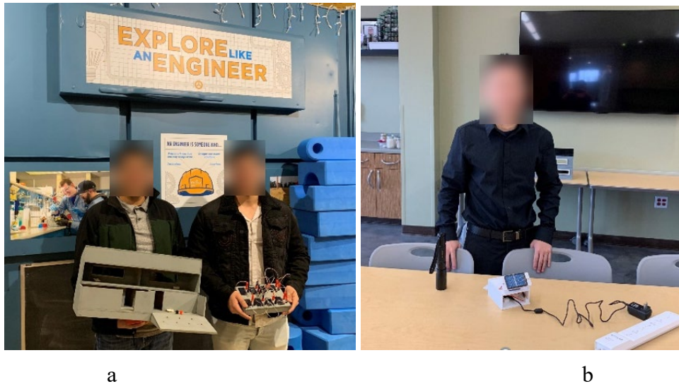
Figure 2: Students presenting their projects to community partners: a) solar home model, b) sun-tracking solar cell

The addition of service learning to the course was an overall success; however, there are several factors to take into account before fully and permanently integrating this approach. These factors are as follows: