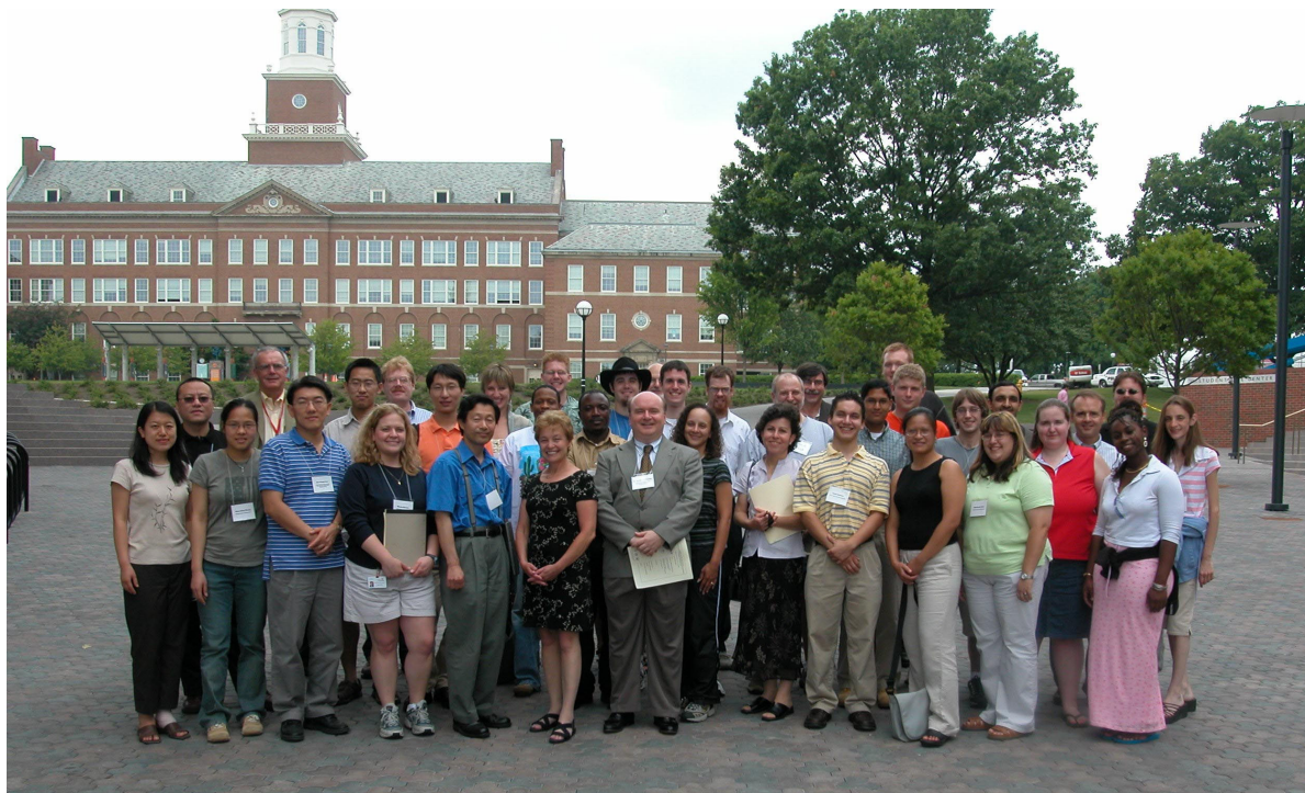
Figure 4: Summer 2004 REU Site program group at the University of Cincinnati.

freshman and sophomore students can benefit tremendously and also contribute to an REU program. It is also important to strive for gender parity and participation by underrepresented minorities. Prior to the formal REU program it is important that a dialogue be facilitated between the REU student and his/her faculty advisor and graduate mentor. It is also important to insure that the faculty advisor order in advance any equipment and supplies necessary for the student's research. An additional measure of hospitality in the form of picking up the students at the airport and being at the dormitories to help them move into their accommodations provides a nice 'personal touch' to get the REU program off to a positive start. A blend of technical, cultural, and social activities is critical to creating a meaningful and enjoyable program. In