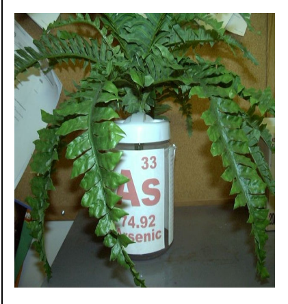
Figure 2 Creative presentation examples include this francium quilt and arsenic display.

Many students in engineering technology programs have connected the project to their major programs. For example, one student in the electronic engineering technology program milled a square of single sided circuit board with the front side solid sheet of