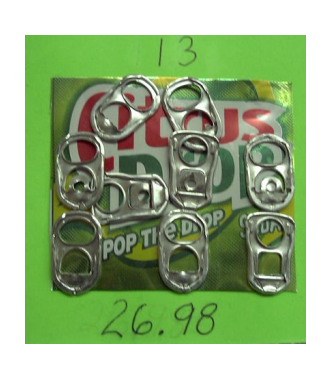
Figure 1 Connecting abstract symbols to daily life experiences (e.g. fluoride in toothpaste, neon lights, chlorine in swimming pools, nickel batteries, and aluminum cans).