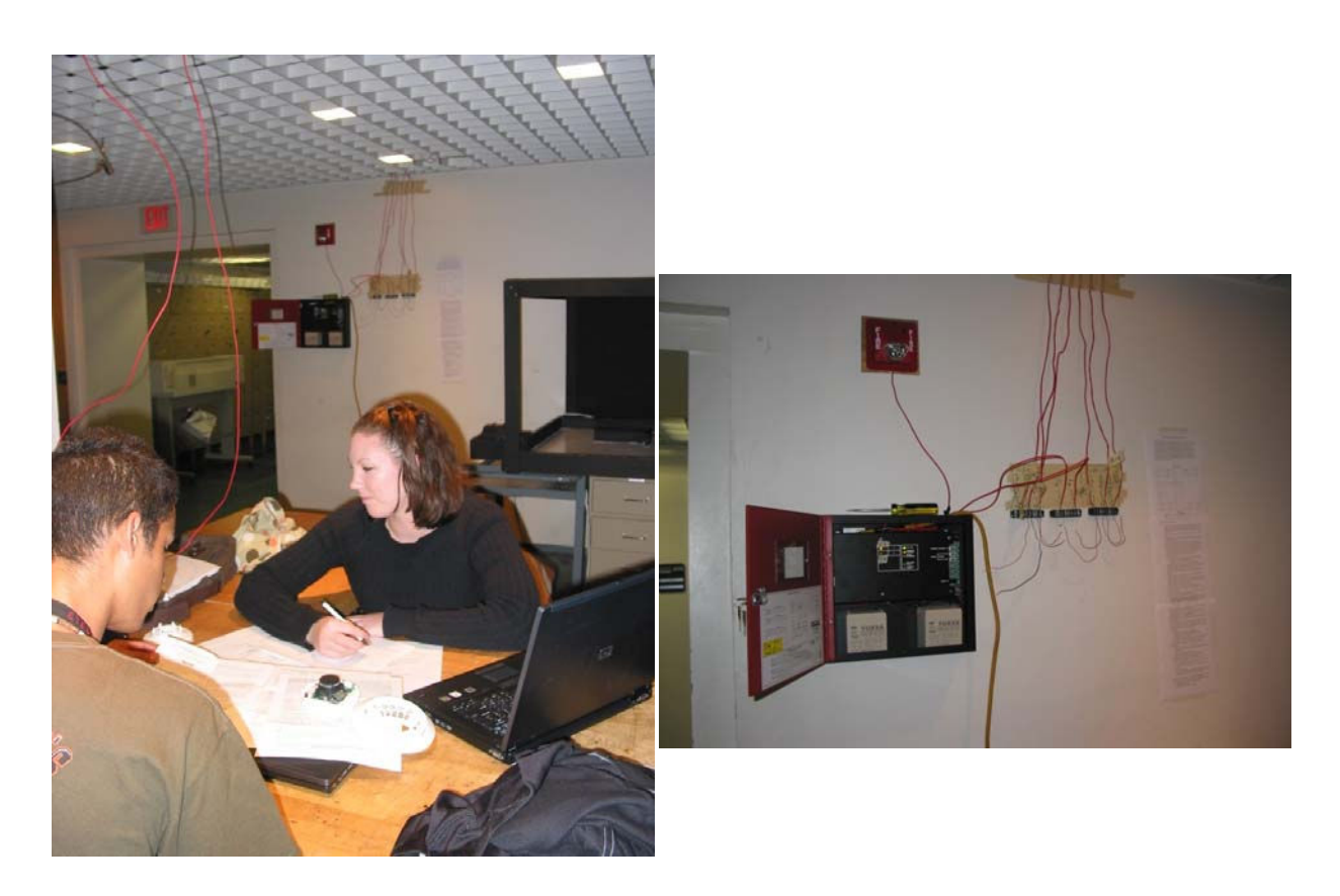
Figure 2. Product Disassembly of a System (Commercial Multi-Zone Fire and Smoke Alarm)

Total design is revisited early when a commercial fire alarm system (multiple units – one per group – connected across the design laboratory to a master monitoring panel) is evaluated and then the individual alarm units disassembled to reveal their sensors (temperature and optical smoke sensors which relate nicely to sensors used in the course). Stakeholder requirements for the alarm system are considered and then the 4th total design stage is introduced, namely Operational Scenarios, in which context diagrams and use case scenarios are developed. This requires a collection of scenarios to be established, one or more for each group of stakeholders for the particular phase of the life cycle – only the first design phase is considered in Freshman year. Each scenario addresses one way a particular stakeholder(s) will want to use, deploy or otherwise interact with the system; it defines how the system will respond to inputs from other systems to achieve the desired effect.