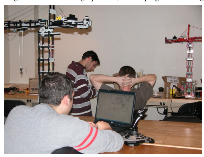
Figure 3. Engineering Design II Crane Project

The second project involves a gantry crane (built from LEGO). The project is posed as a retrofit with sensors for remote control. The team is required to use limit switches and sensors to remotely control, from a laptop computer, crane rotation through a defined angular range, hoist movement and the lateral positioning of a counter weight to balance the hoist. The third project is a compact, deployable, environmental monitoring system that can link to a wireless network and includes monitoring of temperature, wind speed and direction and a simulated hazardous gas (carbon dioxide). Each of these projects is viewed as a system and groups are required to proceed through the first four stages of the total design process, developing context diagrams and use cases on their selected concept.