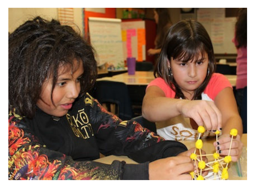
Figure 2. Grade school students working on their TeachEngineering design project.

Development of the TeachEngineering collection was motivated by the following: