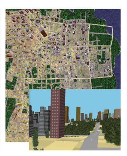
Figure 2. An example of the result of the final project of the advanced course. Plant distribution w.r.t user-defined rules and existing urban layout is simulated on the GPU using CUDA<sup>15</sup>.

how to approach new problems outside the scope of the course (\mu, \sigma) = (3.17, 0.75) . It is interesting that students reported a moderate perception in their performance on assignments and projects in the class (\mu, \sigma) = (2.66, 0.82) , but positive perceptions on their overall performance in the course (\mu, \sigma) = (3.17, 0.75) . Students also reported that taking this course supported their learning enabling them to continue their education in this field (\mu, \sigma) = (3.83, 0.41) .