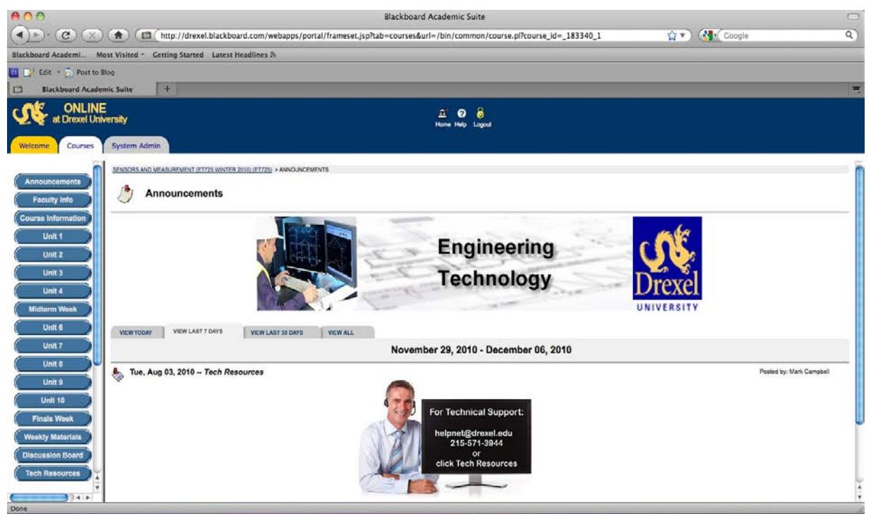
Figure 2. Main course webpage.

The course management website is straightforward, easy to access and handle (Figure 2). All course related materials, such as: lecture notes, power point presentations, assignments, homeworks, exams, solutions, links, etc. are presented in the course management system.