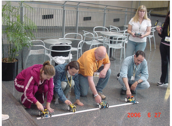
Figure 2: Teachers building Lego<sup>TM</sup> Robots

The "Hands on the Human Body" clinic module focused on comparison of the human body with engineered systems. When most people think of engineering, the human body usually is not the first thing that comes to mind, but the systems of the body can be used to demonstrate engineering principles from all of the major disciplines. Simple experiments using the human muscles were used to demonstrate the concepts of levers and force balances which are very common in Physics. Blood pressure monitors and the human heart were used to demonstrate concepts of hydrostatic pressure in a fluid flow system.