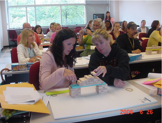
Figure 1: Teachers building bridges using Jenga<sup>TM</sup> Blocks