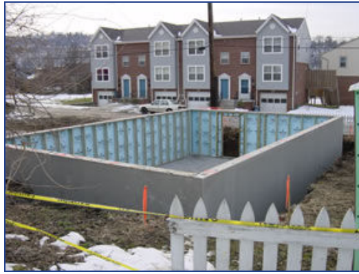
Figure 5. Smart Cottage Foundation