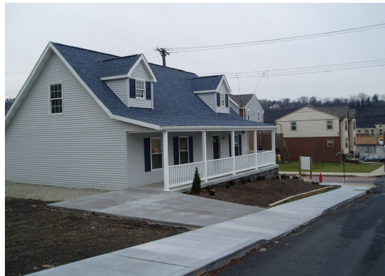
Figure 6. Smart Cottage