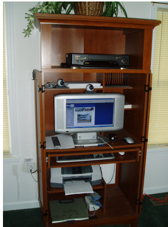
Figure 4. Senior Media Center

The Senior Media Center shown in Figure 4 has a wireless network connection to the server and router in the tech cabinet.