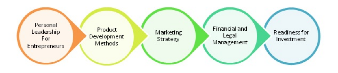
Figure 1: Innovation, Leadership, and Entrepreneurship Framework

higher educational systems have developed degree programs, minors, certificates, and concentrations to provide solutions to the need of today's market demands. In literature, many undergraduate and graduate courses are designed on these topics covering: 1) developing and setting goals and objectives, 2) developing and implementing a healthy business model, 3) establishing growth strategies, 4) key features of a successful leader, sustaining business, and marketing management, 5) establishing financial stability- approaches and strategies, 6) identifying channels to reach customers, 7) developing continuous and sustainable customer relations, 8) developing strategies for business growth, 9) how to develop cash-flow, capital investment needs, income-expense tables, cost-benefit analysis, and marketing strategies, 10) advancements in product development, analysis, and simulation, 11) advancements in production technologies: additive versus subtractive, impact of outsourcing, and cost analysis, and 12) hands-on tips on initiating communication with investors. The new approach focused in this study was to establish a framework integrating all these components into one unique manufacturing course. Figure 1 provides the linkage among these three factors covered in this course.<sup>1</sup>