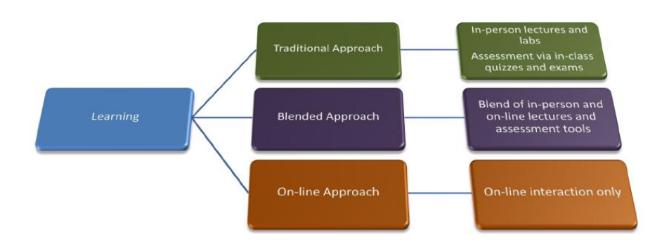
Figure 1: Educational approaches currently used in academia

The second case represents the blended learning which combines face-to-face classroom methods with computer-mediated activities to form an integrated instructional approach.