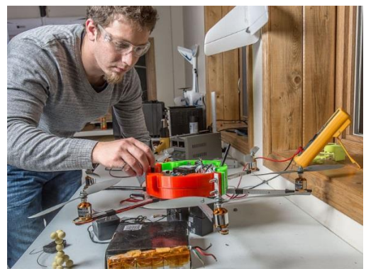
Construction of an early version multirotor at ACUASI

UAS systems developed through this teaming approach have greatly increased the ability of UAF to accomplish important arctic research, provide hands-on experience to our engineering and computer science students, and support STEM development in our local community.