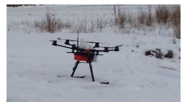
ACUASI Ptarmigan hexacopter

Examples of sensors integrated into the Ptarmigan hexacopter include: 1) a hyperspectral camera which supports analysis of numerous arctic environmental phenomena, such as vegetation health and regrowth after wildfires, presence of minerals in support of resource discovery and oil spill cleanup, and shoreline soil composition for coastal erosion studies; 2) multiple instruments designed to sample particulate matter for volcano and wildfire plumes (optical particle, impact drum sensor, and IR technologies); 3) IR cameras for survey of arctic land and marine wildlife, volcano and wildfire footprints, and monitoring critical oil pipeline/processing infrastructure; and 4) single and multiple camera configurations to precisely measure structural size of vegetation, and create digital elevation models of glacial and sea ice, roads, buildings, etc.