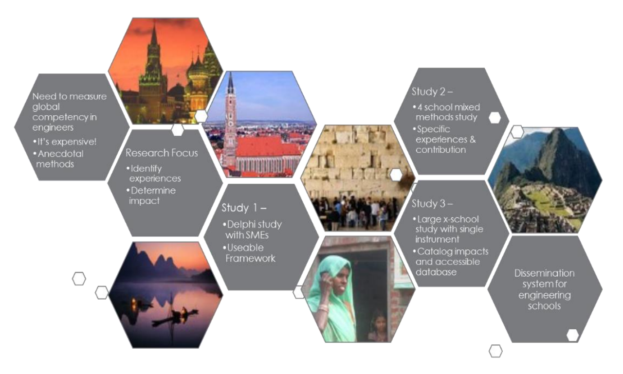
Figure 1. Overview of the Research Agenda

contextual knowledge, personal and professional qualities, and cross-cultural communication skills and strategies. The outcomes from this study were used to produce a model of global engineering preparedness, which helped to provide the basis for a student background instrument that was employed in Study Two, as well as provided a means to determine how certain outcomes were achieved from students' international and global experiences.