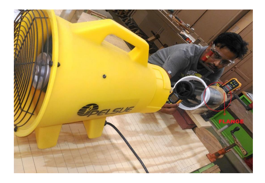
Figure 3: Wind Speed Data collection

The phase two compared a custom constructed wind shroud with a flange at the exit of the device with the most optimal design previously designed. In other words, the researchers identified the most optimal design for the wind shroud during the phase one and added a flange to the same shroud to collect wind data (Figure 3). Collected data was sent to SPSS for t-Test analysis to compare the flange design wind readings with the proven design from phase one. For the phases 1 and 2, the students with different undergraduate backgrounds needed to learn SPSS. As they learned t-Test or One Way ANOVA analyses, they discussed as a team to report the interpretations of the collected data.