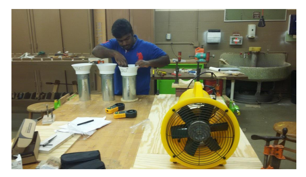
Figure 1: Construction of wind augmentation devices (Civil Engineering Student)

A miniature blower, with the outlet diameter of 7 inches, was utilized to produce an artificial wind in a closed environment as shown in Figure 1. A total number of 90 readings from the anemometer were collected in the laboratory setting for all three designs as illustrated in Figure 2 below. The Industrial Technology students, from various undergraduate backgrounds, collected the wind speed readings to transfer the collected data to IBM's SPSS for One Way ANOVA test.