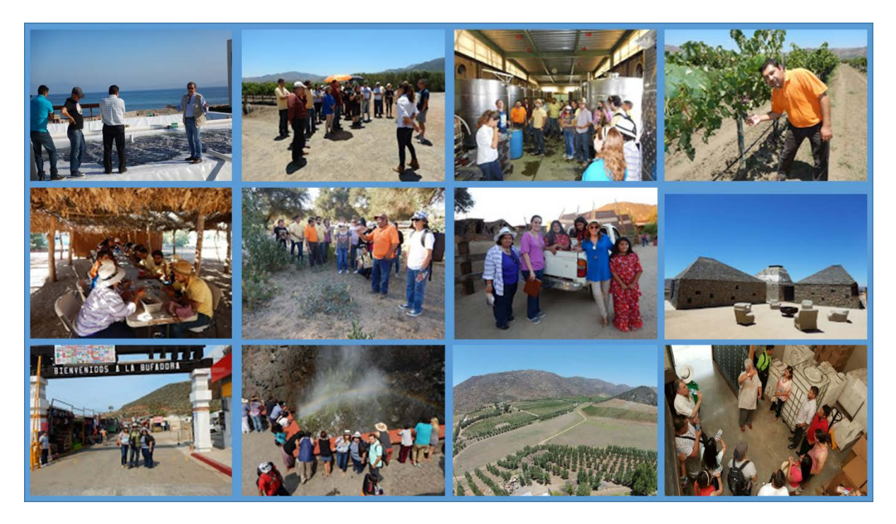
Figure 4 Field trips to the Valley of Guadalupe and Ensenada

In Ensenada, students saw first-hand examples of community needs as well as success stories where sustainability was considered. The group visited 6 different wineries (see Figure 4) to learn about their processes, best practices and current issues with respect to sustainability. The production of wine in Ensenada dates back to the early 1900's when Russians from the Molokan group established in the Guadalupe Valley. The quantity and quality of the wines has increased dramatically in the last decades; this has brought an economic boom as it attracts tourism and detonates other activities such as arts, sports, gastronomy, culture, entertainment and education. This growth challenges the resource in the region, specifically water.