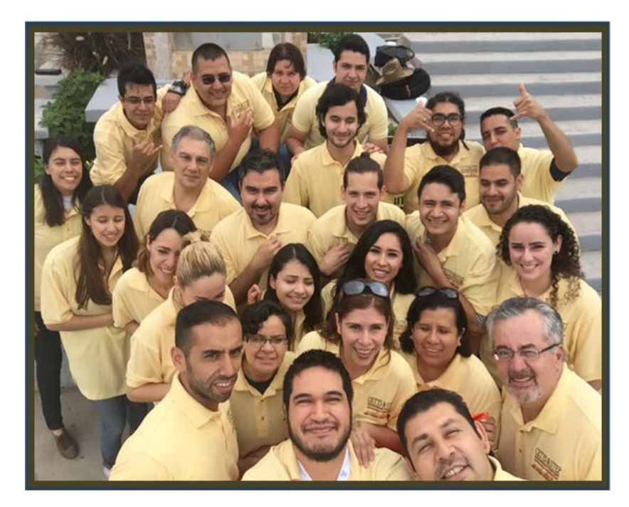
Figure 2 The group on their first day of classes at CETYS Universidad – Campus Ensenada

The UTEP group of students and faculty travelled from Ciudad Juarez (across the border from El Paso) to Tijuana (across the border from San Diego) were CETYS transport vehicles drove them to Ensenada (around 2 hours' drive). All students (see Figure 2) stayed in a hotel just one block from the touristic and commercial area. In retrospective this had some advantages and disadvantages, having easy access to restaurants and entertainment was positive, but at times it also meant too much of a distraction. All logistics for transportation, field visits, and restaurants were efficiently provided by CETYS; their ample experience was a great advantage to adapt to last minute changes and find the best options for visits. UTEP faculty stayed at a hotel on the outskirts of the city, which in retrospective was advantageous and allowed us to focus on our work. UTEP students flew back from Tijuana to Ciudad Juarez while CETYS students drove back for one day (approx. 600 miles) to meet in El Paso to continue the program. UTEP was in charge of all the logistics while in El Paso including lodging, meals, field visits, campus tours, etc.