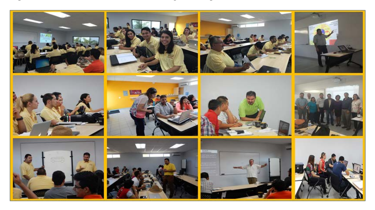
Figure 3 First two weeks of classes at CETYS Universidad-Campus Ensenada

With a rich experience teaching Sustainability Engineering in Peru, the faculty group created a dynamic lecture plan that combined theory and practice. The first two weeks of lectures started in Ensenada (see Figure 3) and continued for one more week in El Paso. The topic of sustainability was covered in its wider sense including People, Profit and Planet, creating an understanding that any technical solution would be limited if other aspects are not considered. Expert researchers from Ensenada were invited to explain the complexities of land and water policies. In El Paso, the lectures turned more technical to take advantage of UTEP's research expertise on water desalination and other high tech topics.