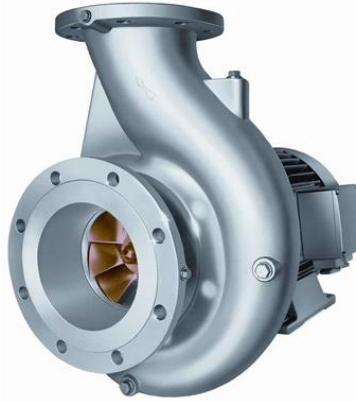
Figure 1. A typical centrifugal pump. 27