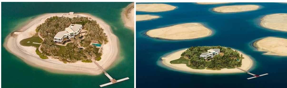
Figure 4. Dubai Islands for sale. 30, 31

Additional EML projects have included swimming pool filtration systems for one of Uncle Mort's Florida hotels, a fire suppression system for his "expensive toys garage," and a hydraulic gantry crane to move his 2015 Ski-Doo Renegade X snowmobile valued at $19,000 up and over his 2002 Ferrari Enzo valued at $1,300,000. 14, 17