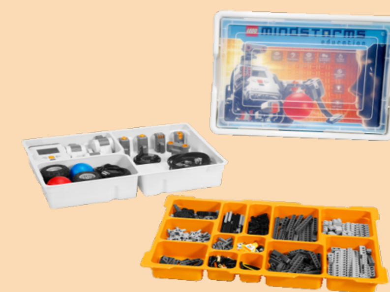
Figure 2. Lego Mindstorms Robotics Kit. Retrieved from http://robotsquare.com/wp-content/uploads/2012/02/NXTEducation-9797Box.jpg

These characteristics of the EDP are thoroughly described in the Nature of Engineering (NOE) views. Originally, authors were inspired by agreed-upon nature of science (NOS) aspects describe the relevant NOE aspects that are targeted in this study. While the aspects of NOS are well established in pre college education, NOE aspects are yet to be operationally defined given the greater emphasis on engineering in NGSS. In our view, nature of engineering (NOE) aspects are similar to NOS aspects except the aspect of the EDP.