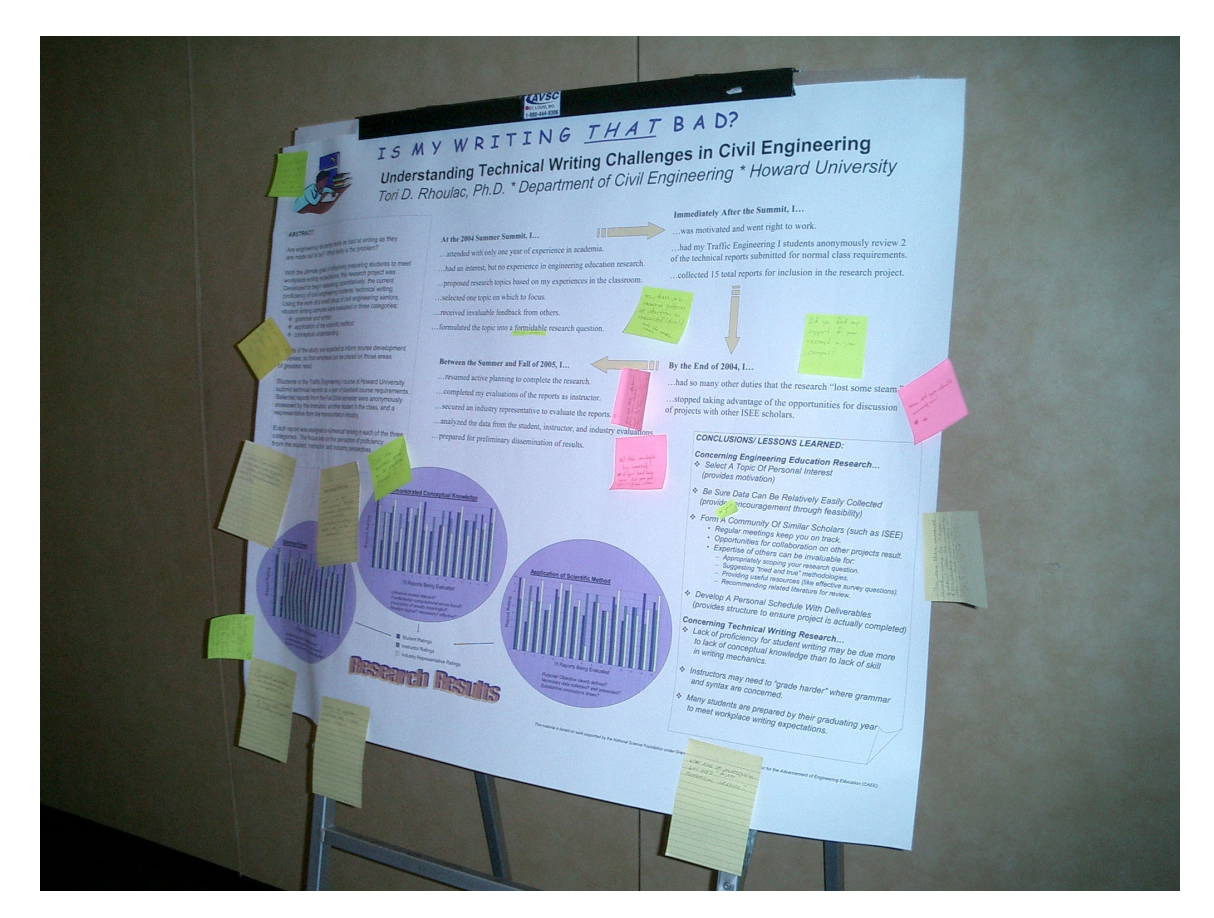
FIGURE 2. Example result from story poster walk (Tori Rhoulac).

The first two session phases (Phases I and II) served to acclimate the audience to the idea of story posters and the ways in which storytelling can help advance engineering education. First, we asked participants to reflect for a couple of minutes on what they've been learning about engineering education research. Then we asked participants to turn to a neighbor and share aspects of their "story". This was followed by a mini presentation describing the session goals and activities. For Phase III we conducted a "story poster walk" where the audience was invited to visit the ISEE Scholars' story posters and to use sticky notes to place comments, questions, or reflections on the posters themselves (see Figure 2). Comments on the sticky notes ranged from asking for more kinds of information (e.g., "What do you mean by this?") to associative statements (e.g., "I did this, too!") to sharing new knowledge (e.g., "I tried something like this and found another way that worked better...").