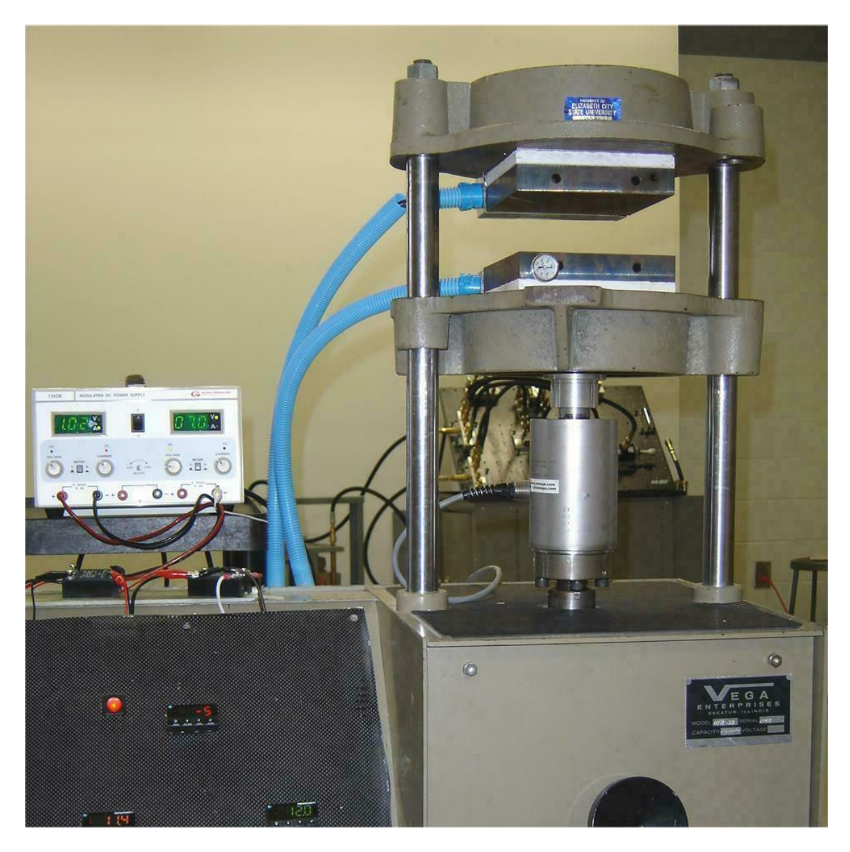
Figure 2. - Upgraded press with new components including heated platens, load cell, relays and three control/ communication units.