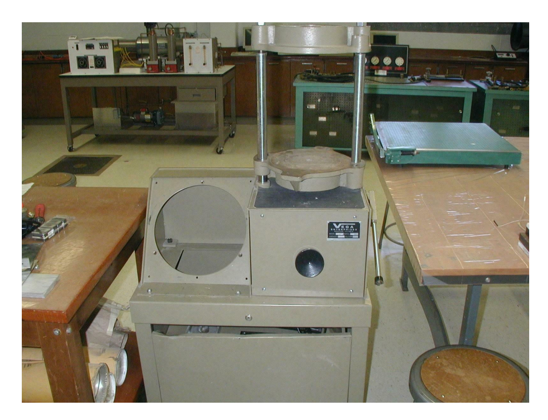
Figure 1. - Original 30-year-old press fitted to perform mechanical tests of materials. The largediameter dial gage measured hydraulic pressure from which the mechanical load on the material was inferred.