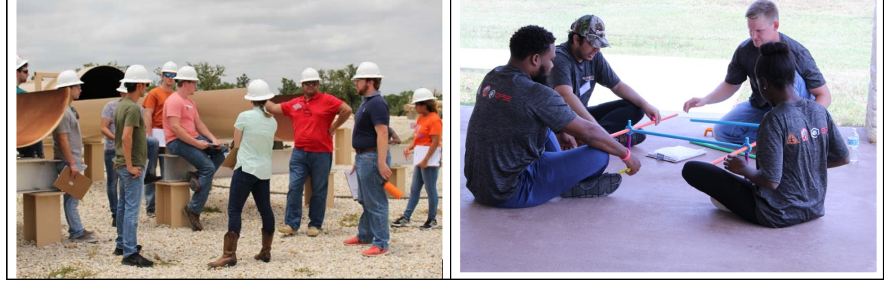
Figure 2. Student activities at minimester class offered at Quanta's LQR Training Facility.