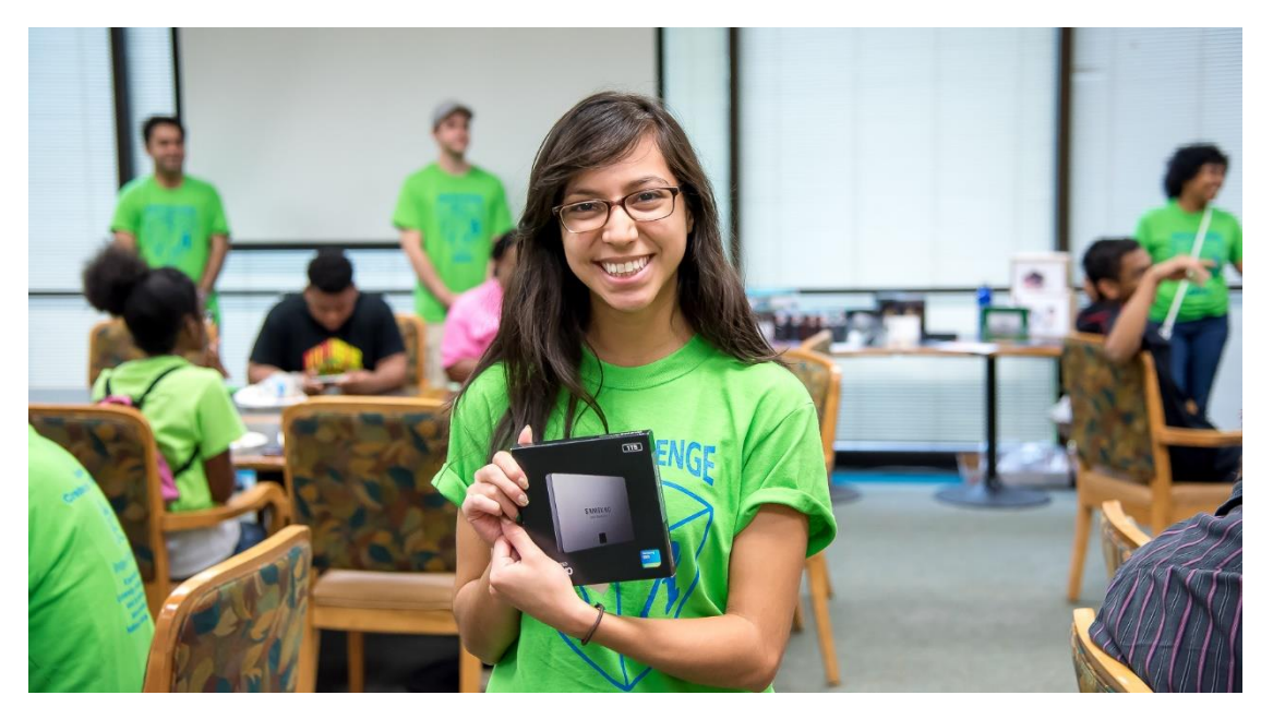
Figure 1: A student receives an SSD as a prize in the 2017 STEM Challenge.

The challenge was open to all high school and undergraduate students. Students from many high schools, community colleges and universities were represented at the event. It consisted of two levels of competition, with all teams showcasing their capabilities in several areas ranging from creative abilities, engineering design abilities, math abilities to software design abilities. A total of 29 teams (19 beginner teams and 10 advanced teams) registered for the event. Each team consisted of a maximum of 4 members.