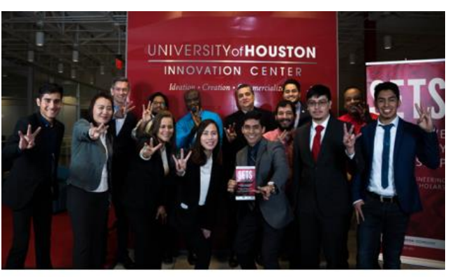
Figure 3 Annual Leadership Development Retreat: SETS Cohort 2017

One focus of the SETS program is to give opportunity for scholars to learn and develop their professional and leadership skills in preparation to become next generation leaders in technology. The industry members of our project advisory board initiated and hosted the first whole day "leadership development retreat" for our scholars in January 2016. Since then, our scholars established the SETS student organization that has been recognized by the University since Fall 2016. They elected officers and hosted regular meetings that not only give them opportunity to practice their professional and leadership skills but also start their own professional network. Their weekly meeting in Fall 2016 hosted most of the faculty mentor research talk. Their bi-weekly meeting in Spring 2017, focuses on developing skills to secure desired position in current job market and identifying inter-disciplinary research projects that all can contribute. These meetings are typically scheduled on Fridays, with the average attendance rate of 72.0% for Fall 2016 and 54.6% during Spring 2017. Given the large number of scholars selected from three programs and from sophomore to junior to senior, it is not easy to achieve