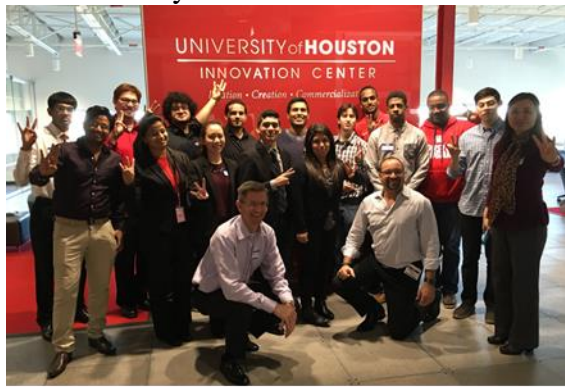
Figure 2 Annual Leadership Development Retreat: SETS Cohort 2016