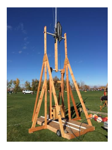
Figure 3. The trebuchet that the S-STEM team built

"I also learned about the difference between design and manufacturability. Just because something looks good from a design perspective does not mean it can be made easily. It is important to consult someone in manufacturing to see if a design can feasibly be built. We learned this during the process of designing the trebuchet arm."