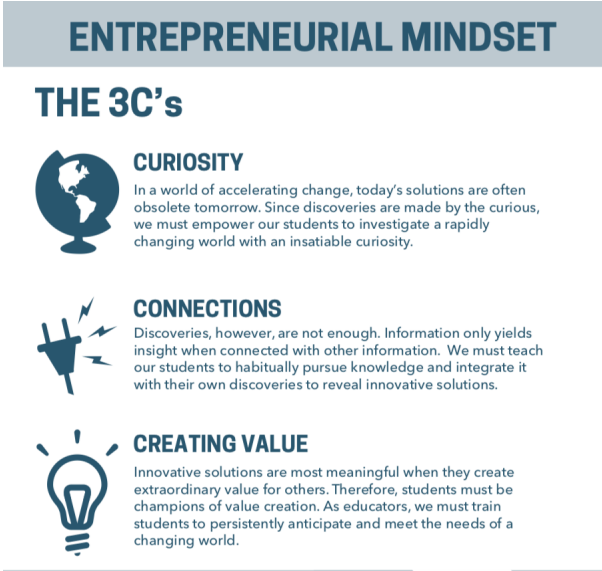
Figure 1: Entrepreneurial Mindset 3C's Framework. [3]