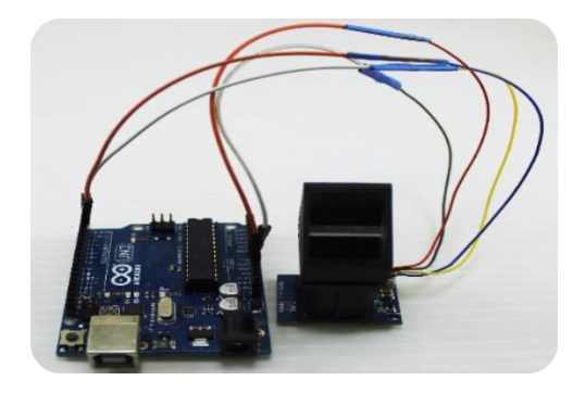
Figure 6. Finger Print Scanner and Door Control System