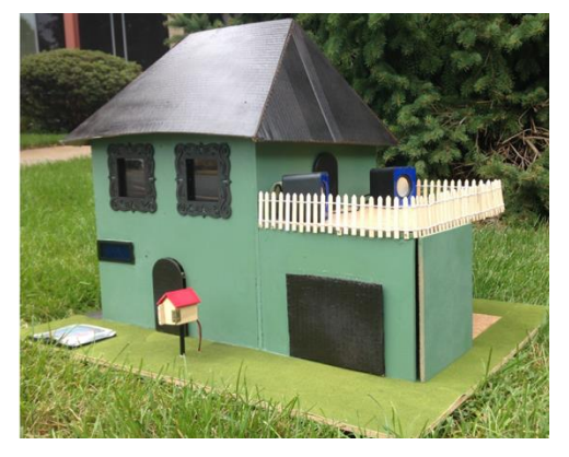
Figure 1. Smart House Prototype

The entire system is built around the Arduino platform. The local control is achieved through a keypad and a LCD display, while the remote control includes an Arduino Ethernet based micro web-server, and an Android based app, which can be used from any Android supported device. The system is affordable, user friendly and easy to adapt, allowing to add new devices and functions, without altering previously built functions. All the functions of the smart house were tested and are fully functional, proving the feasibility and effectiveness of the design. Figure 1 presents the prototype of the smart house, while Figure 2 presents the hardware modules.