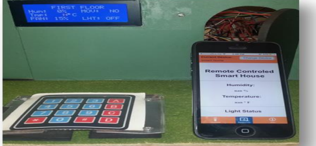
Figure 3. Local and Remote Control of the House

The functions of the house can be controlled locally or remotely as seen in Figure 3.