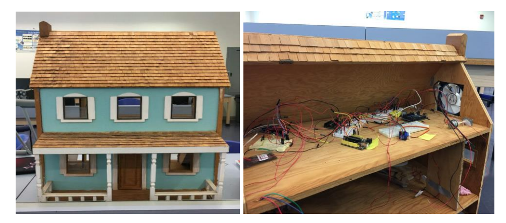
Figure 4. Second Prototype of the Smart House

The focus of the current project is the design of a smart house system fostering enhanced living experience for its inhabitants. Smart house research domain offers means for supporting special needs of people with disabilities Figure 4 presents the prototype of the smart house system, while Figure 5 presents the hardware modules. The entire system is built around the Arduino microcontroller platform and the following sub-systems were implemented: safety and security system, finger print scanner and door control system, elevator control system, and messaging system Figure 6 presents the finger print scanner and door control system.