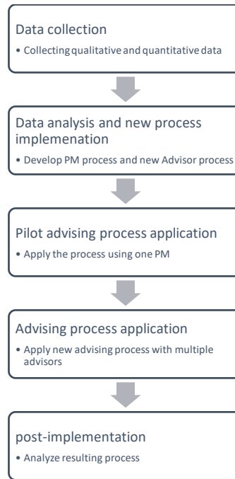
Figure 1 Study Framework

full implementation of the proposed advising process and the analysis of the results. Lastly, we conclude the paper and discuss future work.