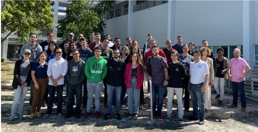
Figure 5: First cohort of RISE-UP students and the faculty team involved.