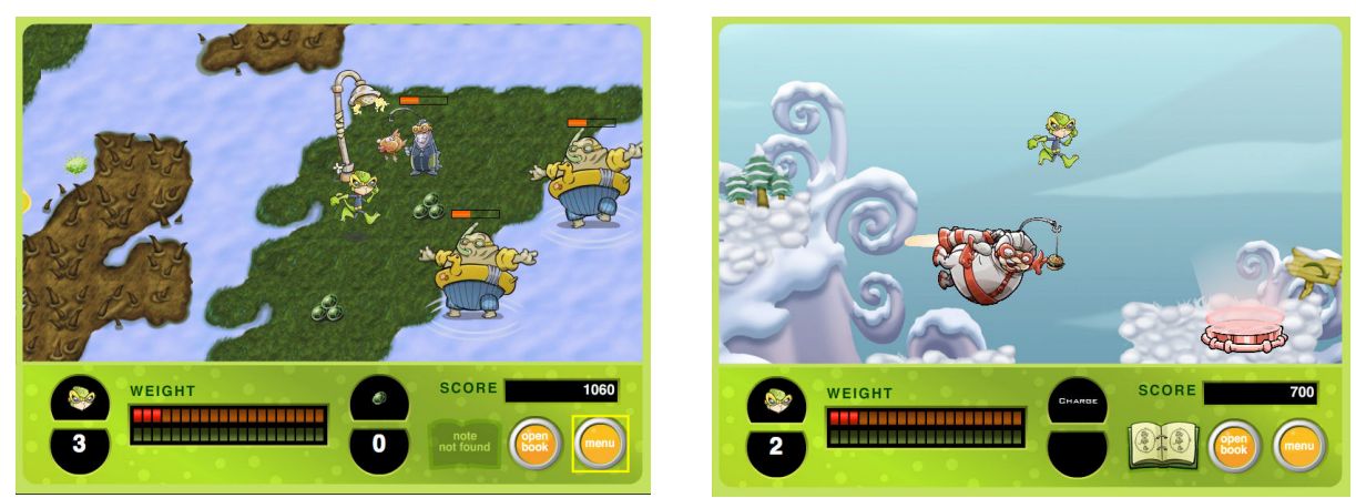
Figure 2 a & b: Depictions of Harold, as Geckoman, evading enemy assault in Worlds 2 and 3

In World 1, players also learn about the effects of surface area on adhesion and can crawl to increase contact with the surface and thus, increase adhesion. In addition, Harold can take advantage of the water "power-up" item, which is found scattered through the levels, to temporarily increase his adhesion. Finally, Harold can lure enemies onto rough surfaces, which decreases adhesion, making it easier for enemies (or Harold) to be pulled off the ceiling and fall.