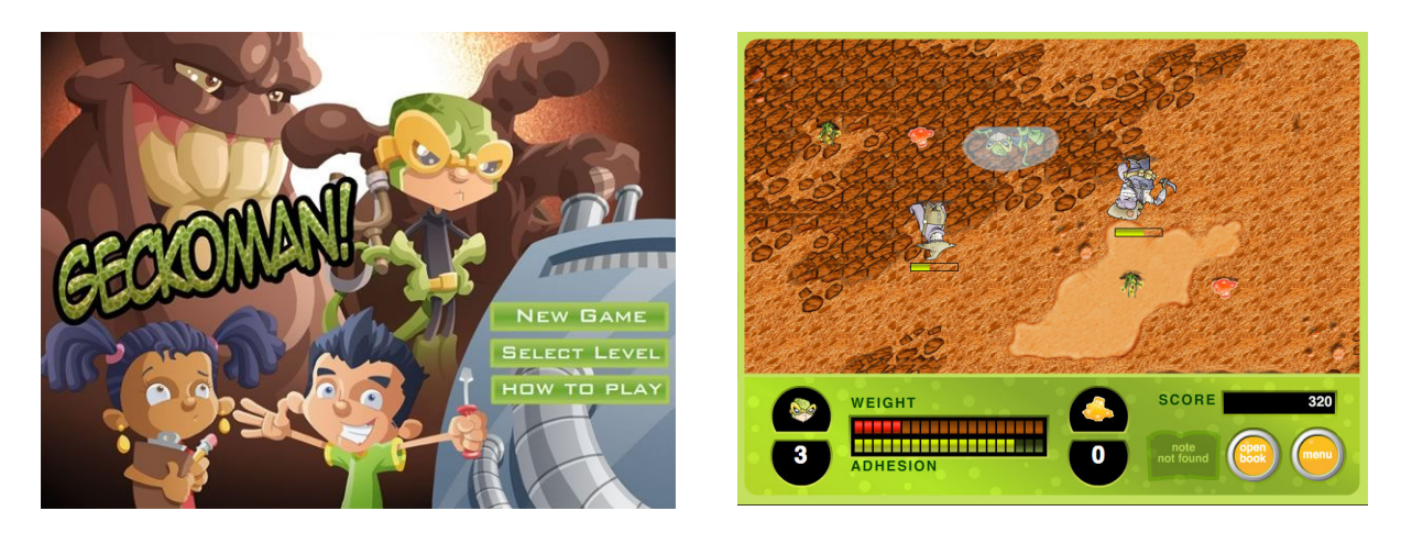
Figure 1 a & b: Screen prints of intro page and World 1 of the Geckoman computer game

World 1 also introduces the Nanoids, the tiny alien race who want to steal Harold's shrinking machine so that they can bring themselves to the macroscale. The Nanoids attack Harold by sticking nanoparticles to him and thus, increase his weight. However, Harold can fight back using the same technique and slingshot gold nanoparticles at the Nanoids in order to increase their weight. In World 1, the Nanoid characters all have an "adhesion" meter over their heads; when the adhesion drops to zero, the Nanoid falls off the ceiling. Harold (the player) has two meters: weight and adhesion. The meters visually emphasize when Harold's weight exceeds his adhesion, gravity is the dominant force, causing Harold to plummet to the floor.