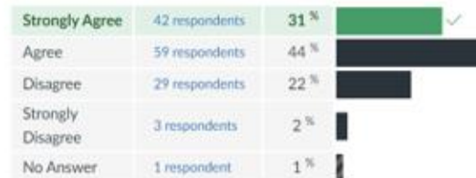
Figure 2: Survey responses

From these student responses it is evident that the majority of the students believed that this project contributed to their understanding of DEI-themed topics in the context of computing. 95% of the students agreed that this project was useful to them, but fewer (88%) students agreed that this project was relevant to their career aspirations, which can be explained by the fact that these were first year students and have not fully grasped the impact their education can have on their future careers. It was heartening to see that 75% of the students agreed or strongly agreed that this project belongs in this first-year computing course.