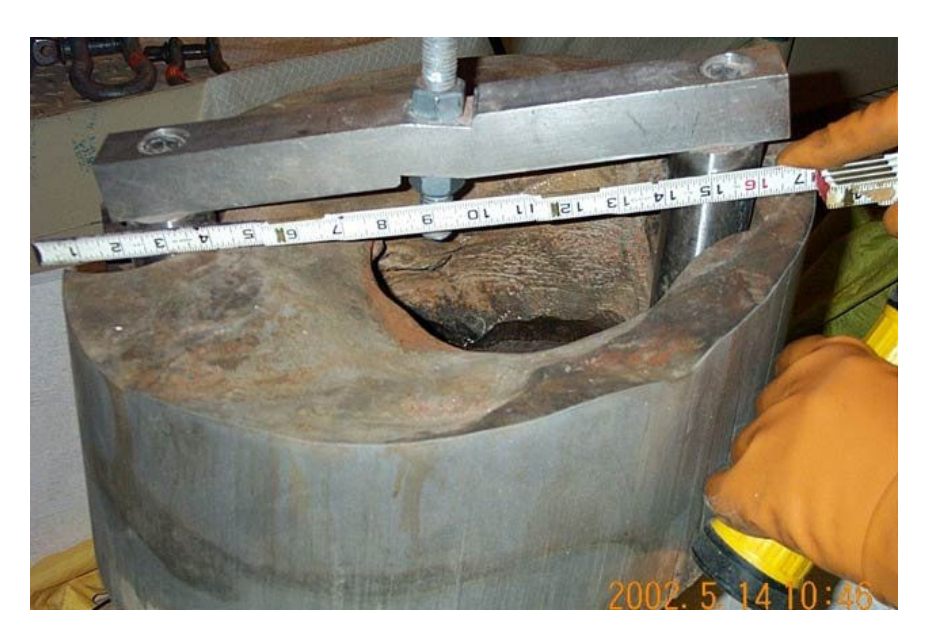
FIG. 4. Cutout from the reactor head with the football-sized cavity. See FIG. 1 for the location of the cavity in the reactor head.

During the next refueling outage in early 2002 the boric acid deposits on reactor head were finally cleaned. Unfortunately, this process revealed that the boric acid had corroded the reactor head leaving a football-sized cavity (FIG. 4). Only the thin stainless steel cladding (see FIG. 1) contained the high pressure coolant in the reactor vessel. This represented one of the most serious safety breaches in US nuclear history.