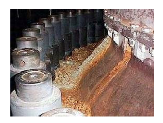
FIG. 2 "White Photo" illustrating boric acid on the reactor head. Photo taken in 1998.