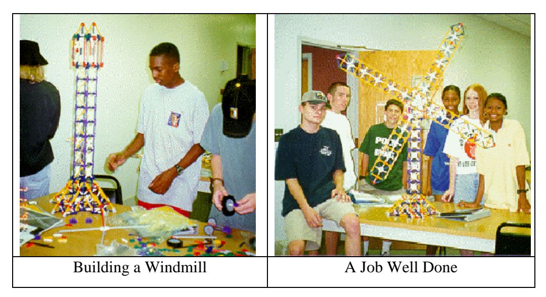
Figure 1. K'NEX Activities on Day 1

Day 1: For the first K'NEX exercise we decided to have the students replicate one of the models shown in the K'NEX manual. We divided the group into teams of six or seven students. We gave each team a GIANT set of K'NEX and told them to build the windmill. In an effort to encourage teamwork, we chose a design that was sufficiently complex that each team member could contribute to the building of the device. By referring to the picture of the device, each team was able to successfully build the windmill within three hours. However, some teams did get discouraged when they couldn't figure out how to construct the device. Occasionally a member of another team volunteered to help a team which was stuck. After building the windmill, most campers were eager to try their own designs.