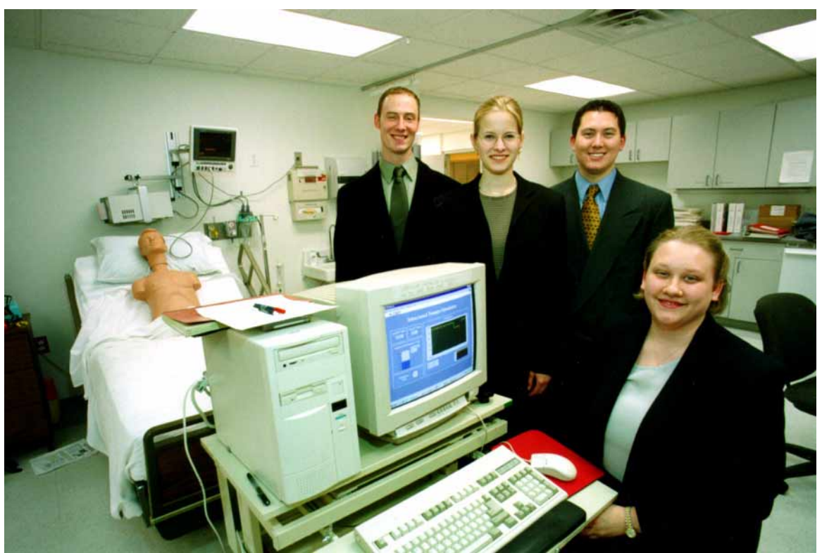
Figure 1: A student design team with their final project at the design show. The project is an intracranial pressure monitoring simulation.

Another sample design project is described in the following design show team abstract (5). Figure 2 shows members of the team demonstrating their project to visitors. This project was more technically challenging and therefore the final product was not developed to the point that a 'customer' could use the end product.