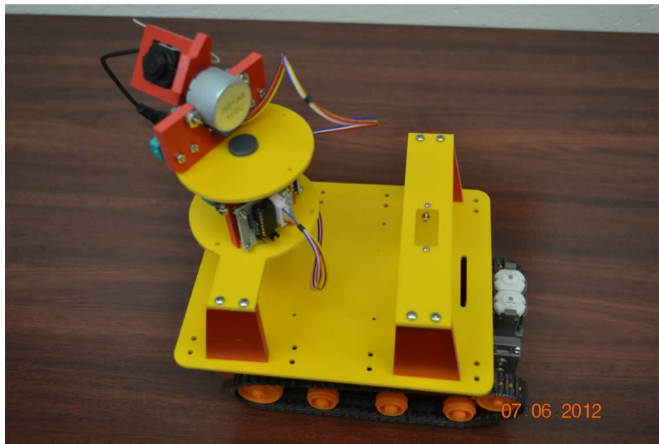
Figure 3. Basic Vehicle Platform

The wireless communication is accomplished using the Microchip® MRF24J40MA module 3 that is a transceiver that uses a radio frequency of 2.4 GHz and follows IEEE standard 802.15.4™. It comes packaged in a surface mounted module with a built in antenna. The module is compatible with the Microchip software stacks for ZigBee® and other common wireless protocols. The module communicates with the microcontroller using the SPI protocol 4 , which requires only three pins – clock, input data, and output data. The module is FCC compliant and has a range of up to 400 feet, according to the Microchip® datasheet. The vehicle uses an analog wireless video camera that relays video from the vehicle to the command center. The camera uses standard stepper motors to position it horizontally and vertically for a view of the vehicle environment as it travels on its journey. The video camera uses a separate composite video transmitter that also transmits on the 2.4 GHz wireless frequency. See Figure 3.