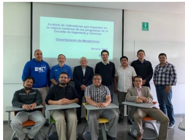
Figure 1. End of year Department Closing Meeting

In the evaluation meeting, Professors suggest and propose actions for continuous improvement to be implemented in the courses in which student outcomes will be evaluated the following semester. The actions and activities for continuous improvement that will be carried out the following year are defined by consensus among the faculty. In addition, a report with the agreements and responsibilities is prepared. The report is sent to all Faculty so that they implement the actions for improvement in the courses in which they will evaluate student outcomes the following semesters. Figure 1 shows the faculty of the department of Mechanical Engineering that attended the meeting at the end of the evaluation cycle in the 2019 summer.