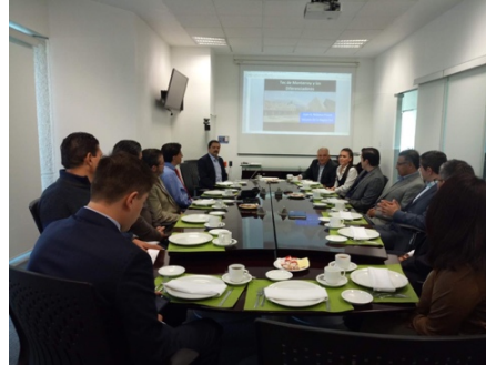
Figure 2. Attendants to the Advisory Board Meeting

of the advisory board. The head of the department, the academic program director, the accreditation specialist and the Director of Division attend this meeting. In the meetings, results of the student outcomes evaluation and assessment are presented to the advisory board in order to ask them for their feedback and to identify jointly areas of opportunity and strengths and thus, together, establish strategies for improving the development of student outcomes to be implemented the following cycle. Figure 2 shows a picture of a meeting with the advisory board that was held in the summer 2019.