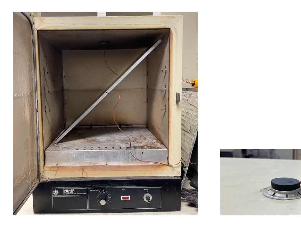
Figure 1. Heating the Plate (left) and Sealing the Oven with a Rubber Stopper (right)

The experimental apparatus is shown in the photographs of Figures 1 and 2.