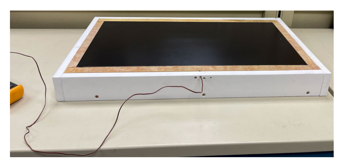
Figure 2. Monitoring the Cooling of the Insulated Plate as it Rests in the PVC Stand