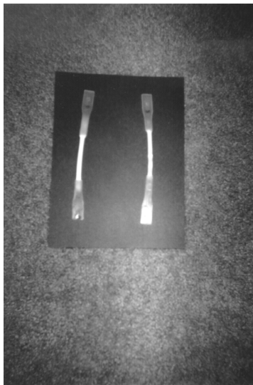
Figure 3: Typical PP specimens of E.G. (left) and S.G. (right) after tensile loading

The result shows that the configuration of gate does not greatly affect the UTS of PP, although the UTS of PP in E.G. is a little higher than that of PP in S.G. Also, the presence of weld line does not play a major role to influence the tensile behavior of PP. The specimens of PP in E.G. and S.G. gradually elongate and fracture in ductile manner at 5mm/min under tensile loading (Fig. 3). The presence of weld lines induced by such different gate configurations may not affect the tensile behavior of PP under the experimental conditions. Thus, the processing parameters of injection molding may contribute to the results of this experiment.