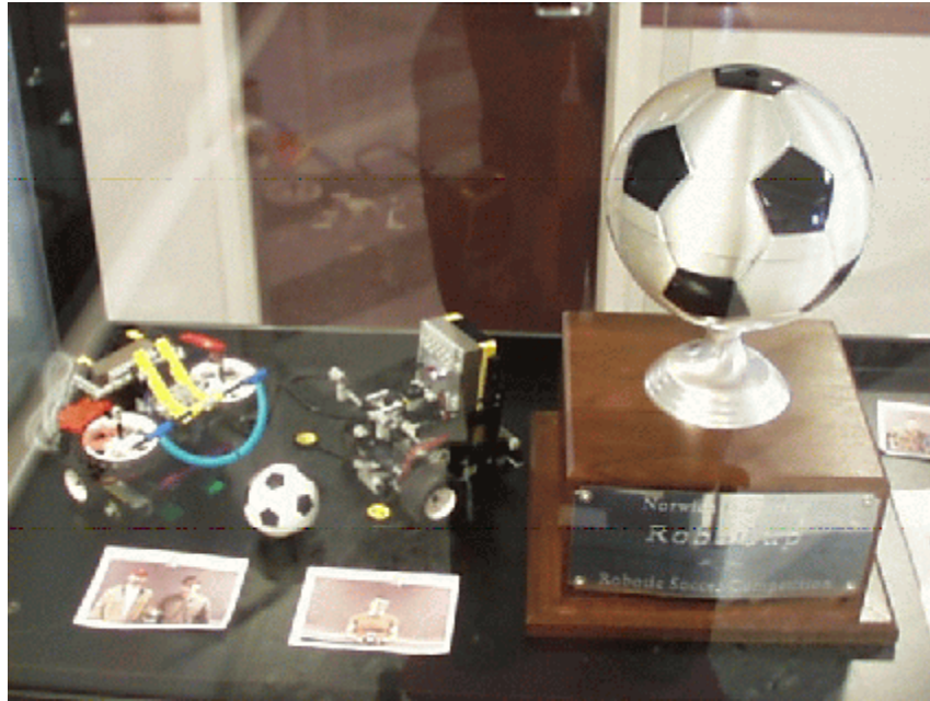
Figure 2: The Norwich University RoboCup Soccer Trophy