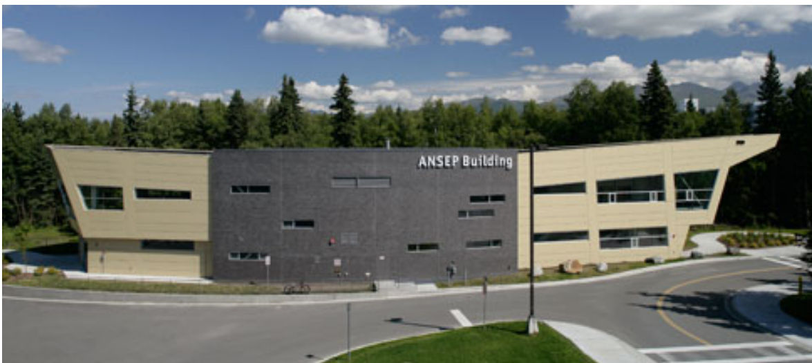
Photo 1: The Alaska Native Science & Engineering Building on the University of Alaska Anchorage campus.

The ANSEP partners provided the funding necessary for construction. The students drove the design process and were adamant that the building overtly reflect Native culture and values. The building opened in October 2006. Having dedicated space provides an excellent venue for each of the ANSEP programmatic components.