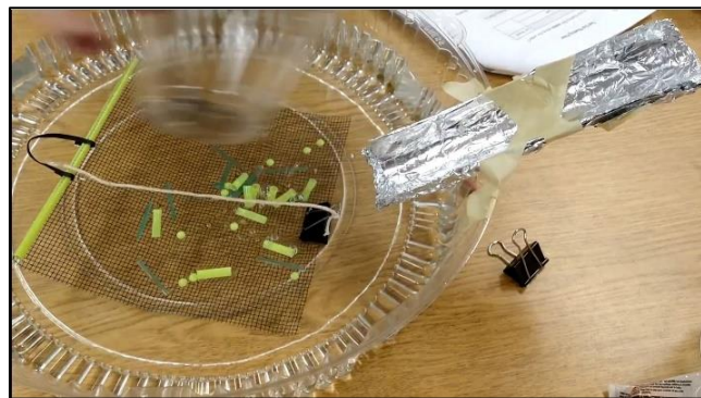
Figure 2 - A photo of a floating filter and a screenshot of a video of the filter test

their technology. These were submitted as “assignments” through Google Classroom.