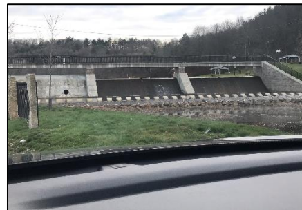
Figure 1- Paper mill and dam used by teachers as an example of technology

Teachers also submitted photos and videos of their floating water filters and penguin habitats for others in the class to see. These submissions are also being used as data sources. Figure 2 shows the photo of a prototype and a screenshot of a video submitted to demonstrate the performance of