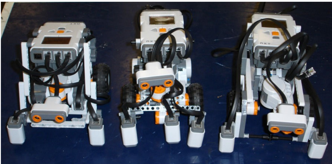
Figure 3. Some final robot hardware designs

Engineering and computer information systems students of sophomore, junior, senior, and graduate standings took the course. Students constructed and programmed robotic vehicles to traverse a miniaturized route using LEGO Mindstorms NXT sets. Some final robot designs are shown in Figure 3.