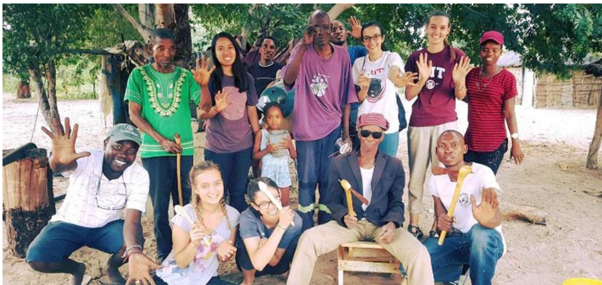
Figure 1 Team Botswana: D-Lab Student Fieldwork in January 2018

Community activities, mainly includes Communities of Practice, International Development and Design Summit, provide opportunities and ways for engineering students to reach out to poverty-stricken areas, grasp the actual needs of the poverty groups. On this basis, engineering students can carry out “knowledge creation” and “research and development of inclusive products”. For example, in January 2018, a team of five students from the D-Lab: Development class traveled to D’kar and Kaputura, Botswana for three weeks of project work, relationship building, and cultural experiences (Figure 1).