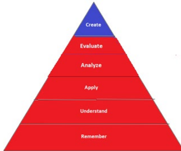
Figure 1: Six levels of cognitive development in Bloom's taxonomy