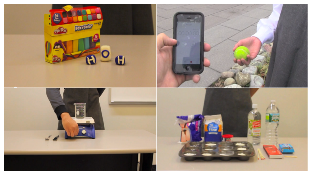
Figure 2. Screen captures of four activities or demonstration videos. The videos were embedded as links within CorePal and hosted on <u>YouTube.com</u>. Each video is approximately a minute in length.

demonstration. The descriptions on YouTube provide quick overviews of the activities, however detailed steps and discussion points are included within CorePal.