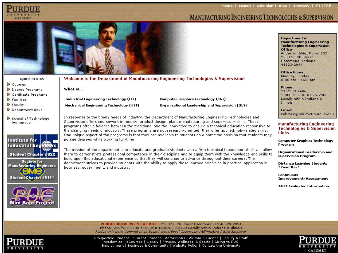
Figure 1 – METS Department Home Page

accredited programs in Industrial Engineering Technology and Mechanical Engineering Technology as well as unaccredited programs in Computer Graphics Technology and Organizational Leadership & Supervision which accounts for the page's complexity. Also noteworthy is the fact that the documentation and continuous improvement efforts are at a department level, not a program level. The efforts conducted are for both accredited and non-accredited programs because the efforts are worthwhile continuous improvement activities, not simply accreditation efforts.