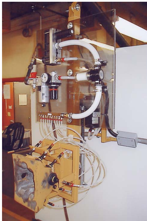
Figure 4 – Completed lifting device