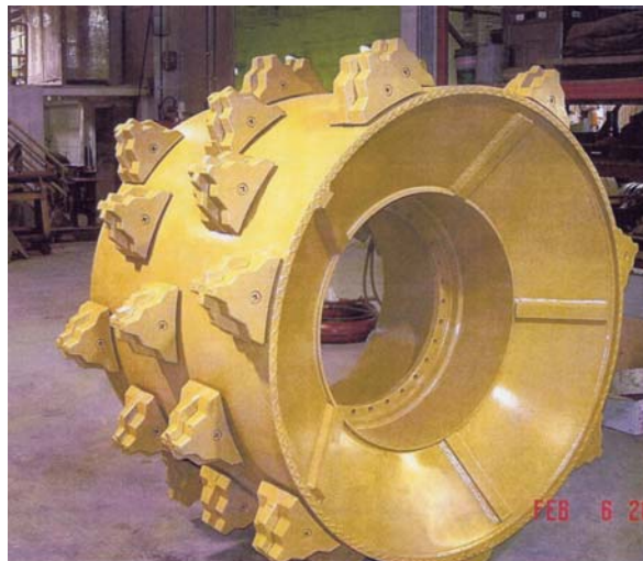
Figure 1 – Lug attachments on compactor wheel

Based upon the goals and outcomes which have been developed for the NIU Engineering Technology senior capstone course, the following details the research, design, and construction tasks completed within a typical project. It should be noted that one of the initial goals and outcomes of this course was the interdisciplinary aspects of manufacturing and electrical students working in teams. However, this project was completed by a group of four MET students. The project was supplied by a regional division of Caterpillar, and it represented an excellent opportunity to blend many aspects of the MET curriculum with a real-world industrial problem. The project arose from the need to apply 50# steel lugs to a steel wheel (figure 1).