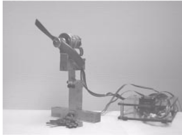
Figure 3 - Typical support/transducer prototype