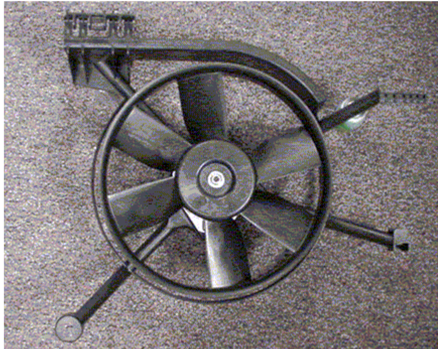
Figure 2: Automotive radiator fan assembly used for first year case study, courtesy of Valeo.

The primary case study was provided by Valeo, a local company, in the form of an automotive radiator fan assembly (Figure 2). The recurring reference to the same assembly case gives the students a complete picture of what is needed to design, manufacture and assemble a real product and they achieve a level of confidence and familiarity that is often missing in first year students 3 .