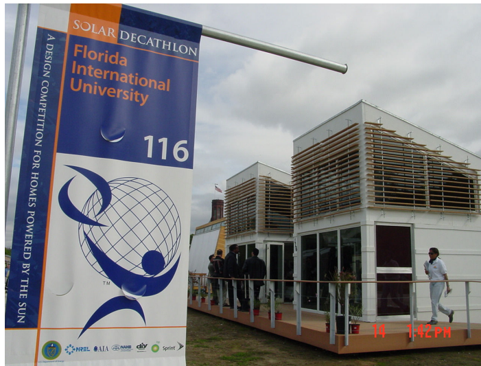
Figure 3 shows the completed FIU solar house, its transportation process to the National Mall, and its evaluation by the competition judges.

Because of the limits in available resources and initial funding, students could not freely decide upon the desired materials and products to be used; rather, they worked around the available ones donated by sponsors and their deliverability within the tight time frame. Because of this factor, students learned how to reach the compromises that were necessary to completely build the house, disassemble it and transport it to the competition site – the National Mall in Washington, D.C. – within the allotted time. Students and faculty faced many challenges, but eventually successfully completed the construction and entered the 2005 Solar Decathlon competition.